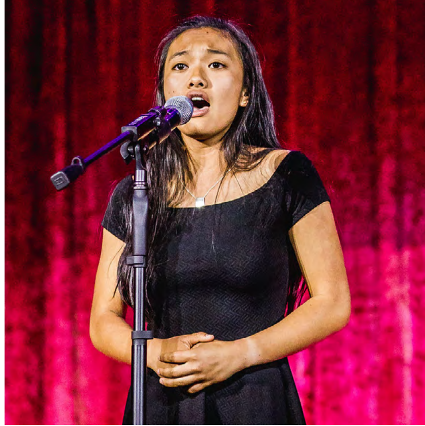
2017 Jazz & Beyond